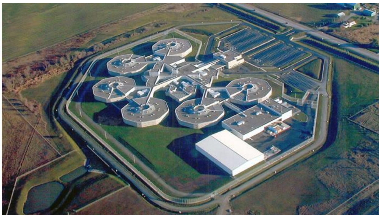
Figure 2: A ‘Superjail’ in Ontario

closed many of its smaller local jails in favour of large austere regional facilities that provide few programs and resources to prisoners. By the early 2000s, two new ‘superjails’ were constructed in the greater Toronto region (JHSO, 2006). These facilities operate under a model of closed supervision, which moved staff outside of the living units and restricted their interaction with prisoners to an ‘as-needed basis’ (Ibid). 25 This was a significant departure from the model of direct supervision that had been in place at the smaller jails. Under a direct supervision model, correctional officers work on the living units and engage directly with prisoners (Sexton, 2012; see also Sapers, 2017).